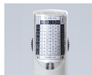
Fast volume selection with the volume table on the back side