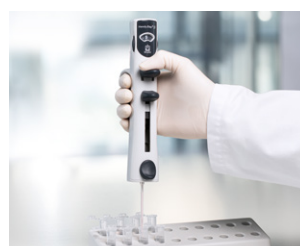
Dispensing small volumes