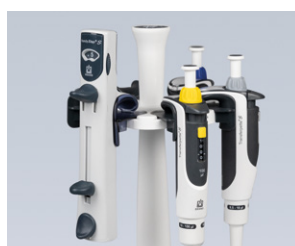
The rack mount also fits the Transferpette® S bench-top rack.